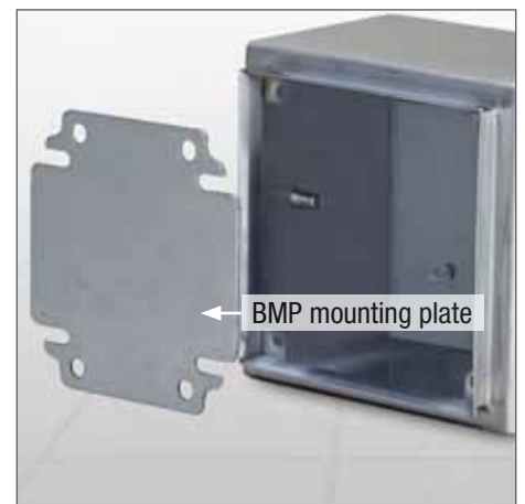
Detail of BPP mounted directly on the studs of the base