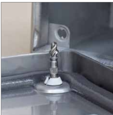
Detail of the quick-fixing screw