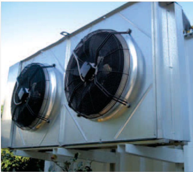
Thanks to the Liebert® HPA, the SmartMod™ does not need any additional external cooling connection.