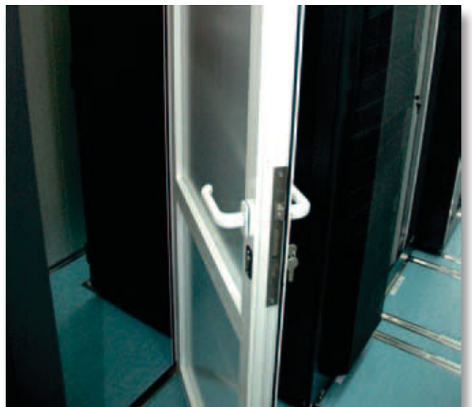
The internal enviroment has been divided in two sections, easily breaking down any space constraints.