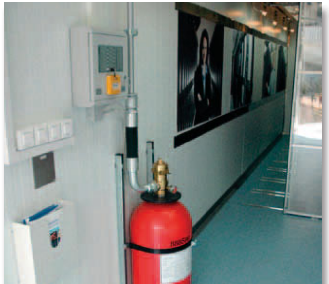
Fire estinguish equipment for a maximum safety environment.