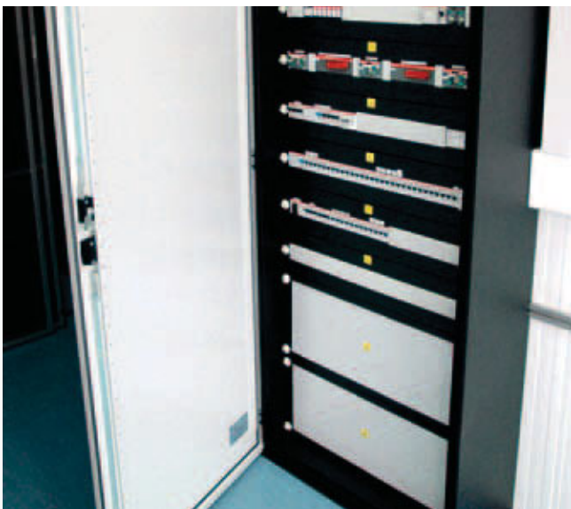
Power distribution cabinet with automatic transfer switch (ATS) from Asco, another division of Emerson Network Power.