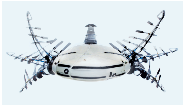
Aqua_ray without skin

Analysis of various types of movement through water has established that rays are perfectionists in submarine “flight” and gliding. The up-and-down motion of their flanks in water closely resembles the flapping of a bird’s wings in the air. This wavelike movement perfectly combines maximum propulsion with minimum energy consumption. The streamlined form lends graceful movement to the manta ray, in particular, and makes it a veritable submarine acrobat.