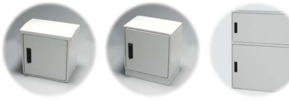
Floor mounting frame