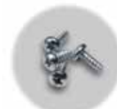
KN 3.9 x 9.5-10 SET