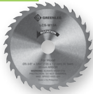
LCS-W13A CARBIDE-TIPPED WOOD CIRCULAR SAW BLADE - 5-3/8" (REGULAR)