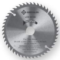
LCS-W13B CARBIDE-TIPPED WOOD CIRCULAR SAW BLADE - 5-3/8" (THIN)