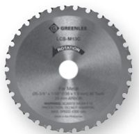
LCS-M13C CARBIDE-TIPPED METAL CIRCULAR SAW BLADE - 5-3/8" (REGULAR)