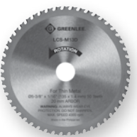
LCS-M13D CARBIDE-TIPPED METAL CIRCULAR SAW BLADE - 5-3/8" (THIN)