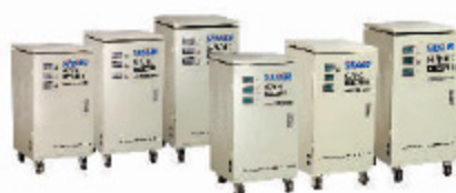
SVC-15000, 20000, 30000 Vertical (Pointer meter)