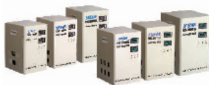
SVC-5000, 8000, 10000 Vertical (Pointer Meter)