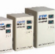
SVC-6000, 8000, 10000 Vertical (Digital meter)