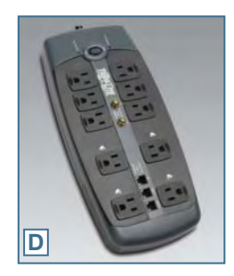
TLP1008TELTV Similar Housing: TLP1008TEL (Without Coaxial Connectors)