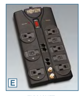
TLP810NET Similar Housing: TLP808TELTV (Without Tel/Ethernet Jacks, With Tel/Modem Splitter)