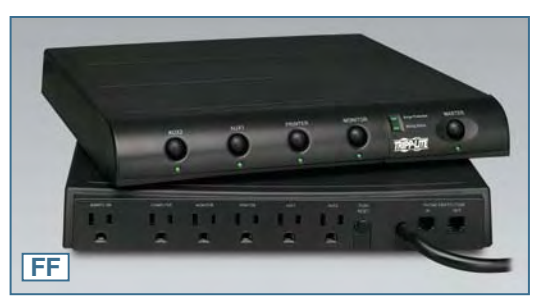
TMC-6 (Front and Back)