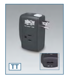
TRAVELER100BT Similar Housing: TRAVELER (Without Tel/Ethernet Jacks, With Tel/Modem Jacks)