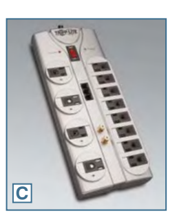
TLP1208TELTV Similar Housing: TLP1208TEL (Without Coaxial Connectors)