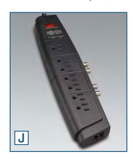
HT706TSAT Similar Housing: HT706TV (Without Tel/Modem Jacks, Single Pair of Coaxial Connectors)