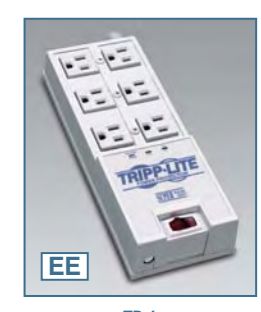
TR-6 Similar Housing: TR-6FM (With Tel/Modem Jacks)