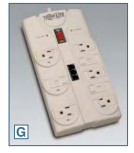
TLP808TEL Similar Housings: TLP808 and TLP825 (Without Tel/Modem Jacks)