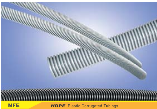
NFE HDPE Plastic Corrugated Tubings