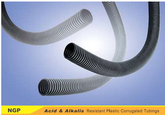
NGP Acid & Alkalis Resistant Plastic Corrugated Tubings