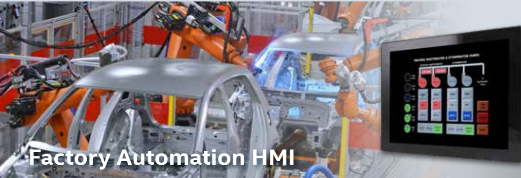
Factory Automation HMI